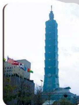
[台北101國際金融中心] [Taipei 101 Financial Center]