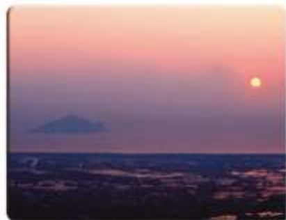
[龜山日出 Kwei-shan Sunrise]