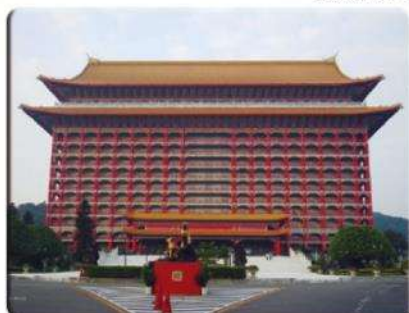
[圓山大飯店 The Grand Hotel]