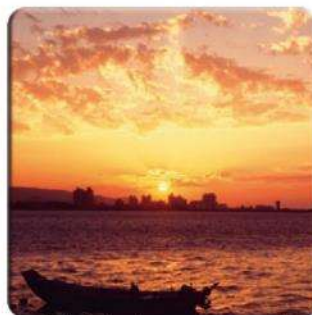
[淡海夕照 Tanhai Sunset]