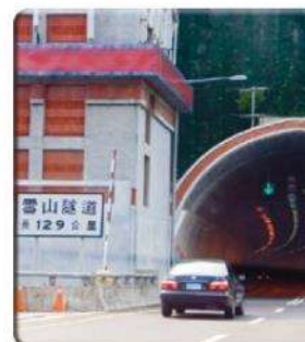
[雪山隧道 The Hsuehshan Tunnel]