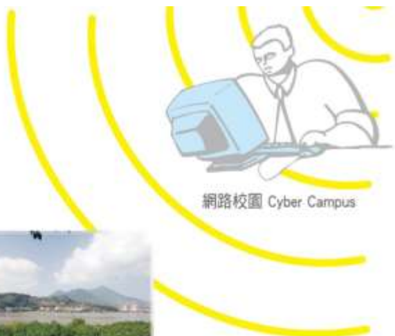
網路校園 Cyber Campus