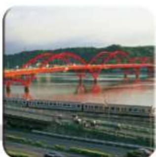
[關渡大橋 Kuan-tai Bridge]