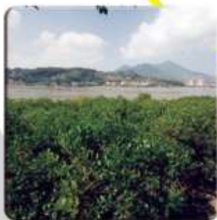
[淡水河紅樹林自然保留區] [Mangrove Conservation Area]