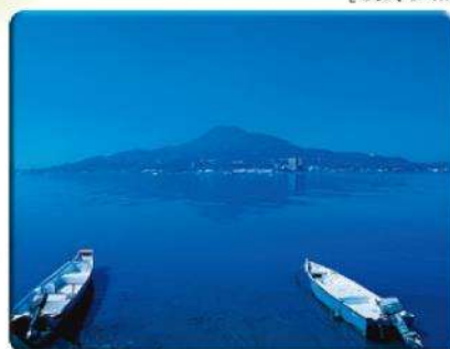
[觀音山 Kuanyin Mountain]